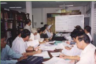
Human resource development