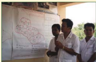
Health service delivery