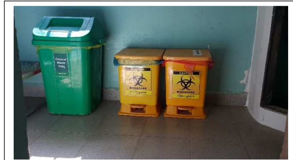
Good waste segregation – Siem Reap RH