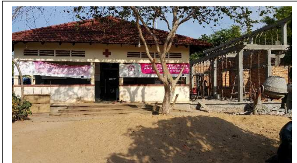
Sand stock of new ADR blocking access to HC - Tipo