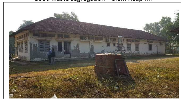
Location of burning area is very close to operation room – Kralanh RH