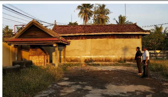
Malfunction incinerator - Kampong Thom RH