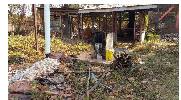
Storing and malfunction of incinerator – SothNikum RH