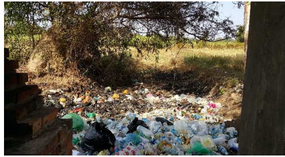
Burning medical waste and general waste on the ground – Baray RH