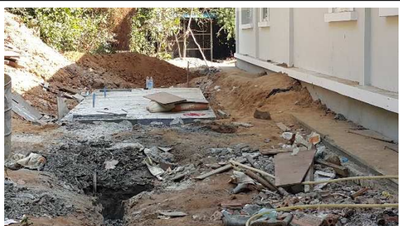
Construction waste – Stoung RH