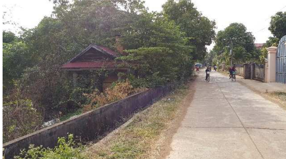
Incinerator that Affect the nearby village – Prey Chhor RH