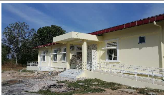
New Maternity Building - SreySanthor RH