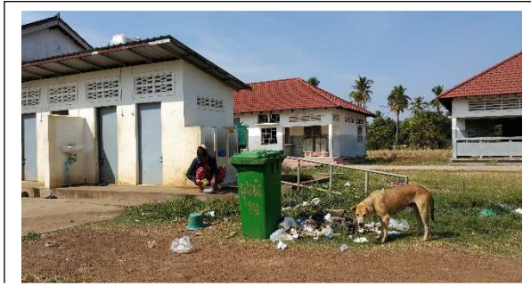
Kitchen waste that need to be proper managed – Baray RH