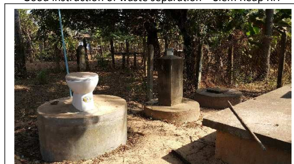
Good medical waste management – PongroKrom HC