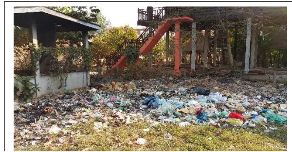
Medical waste and general waste burn near village/house – SothNikum RH