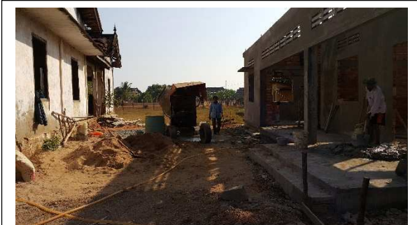
Concrete mixing machine that block passage to Toilet – Sambo HC